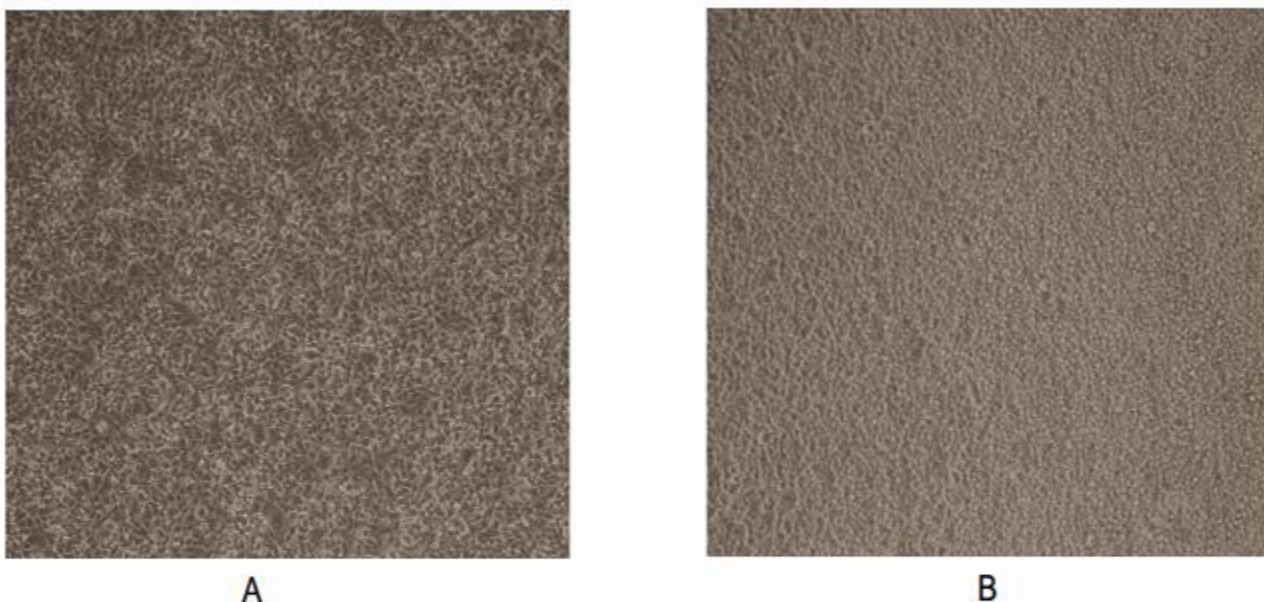
Figure 1. Morphological change of Raw 264.7 cells after stimulation of IFN \gamma .

(A) Raw 264.7 cells cultured in DMEM, stimulated with IFN \gamma ;