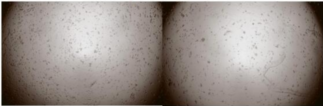
A ..... B Figure 1. Cell proliferation of TF-1 cells after stimulated with NGF.

EPYTDS NVPEGDSVPE AHWTKLQHSL DTALRRARSA PTAPIAARVT GQTRNITVDP RLFKKRRLHS PRVLFSTQPP PTSSDTLDD FQAHGTIPFN RTHRSKRSST HPVFHMGEFS VCDSVSVWVG DKTTATDIKG KEVTVLAEVN INNSVFRQYF FETKCRASNP VESGCRGIDS KHWSYCTTT HTFVKALTTD EKQAAWFIR IDTACVCVLS RKATRRG