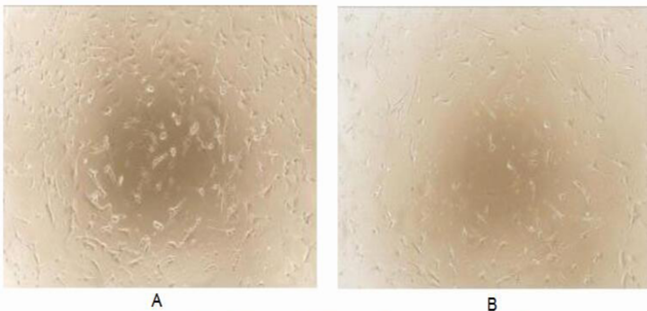
Figure 1. Cell proliferation of 3T3 cells after stimulated with AGE.

(A) 3T3 cells cultured in DMEM, stimulated with 1ng/mL AGE for 48h;