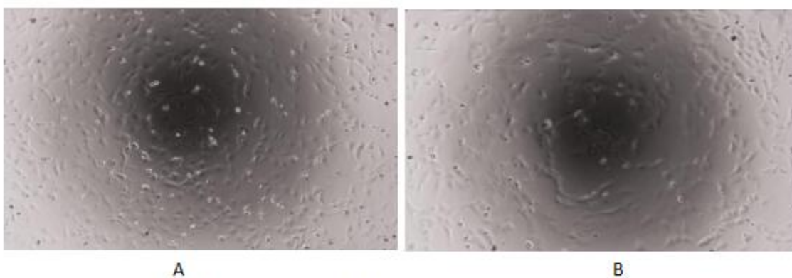
Figure 1. Cell proliferation of Balb/c 3T3 cells after stimulated with FGF17.

(A) 3T3 cells cultured in DMEM, stimulated with 1000 ng/ml FGF17 for 48h;