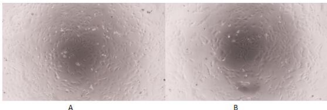
Figure 1. Cell proliferation of Balb/c 3T3 cells after stimulated with FGF20.

(A) 3T3 cells cultured in DMEM, stimulated with 1250 ng/ml FGF20 for 48h;