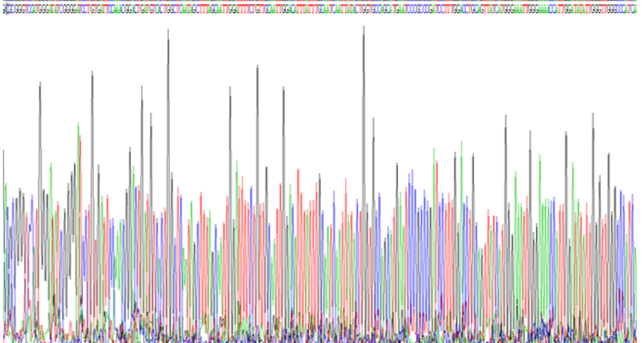
Figure . Gene Sequencing (extract)