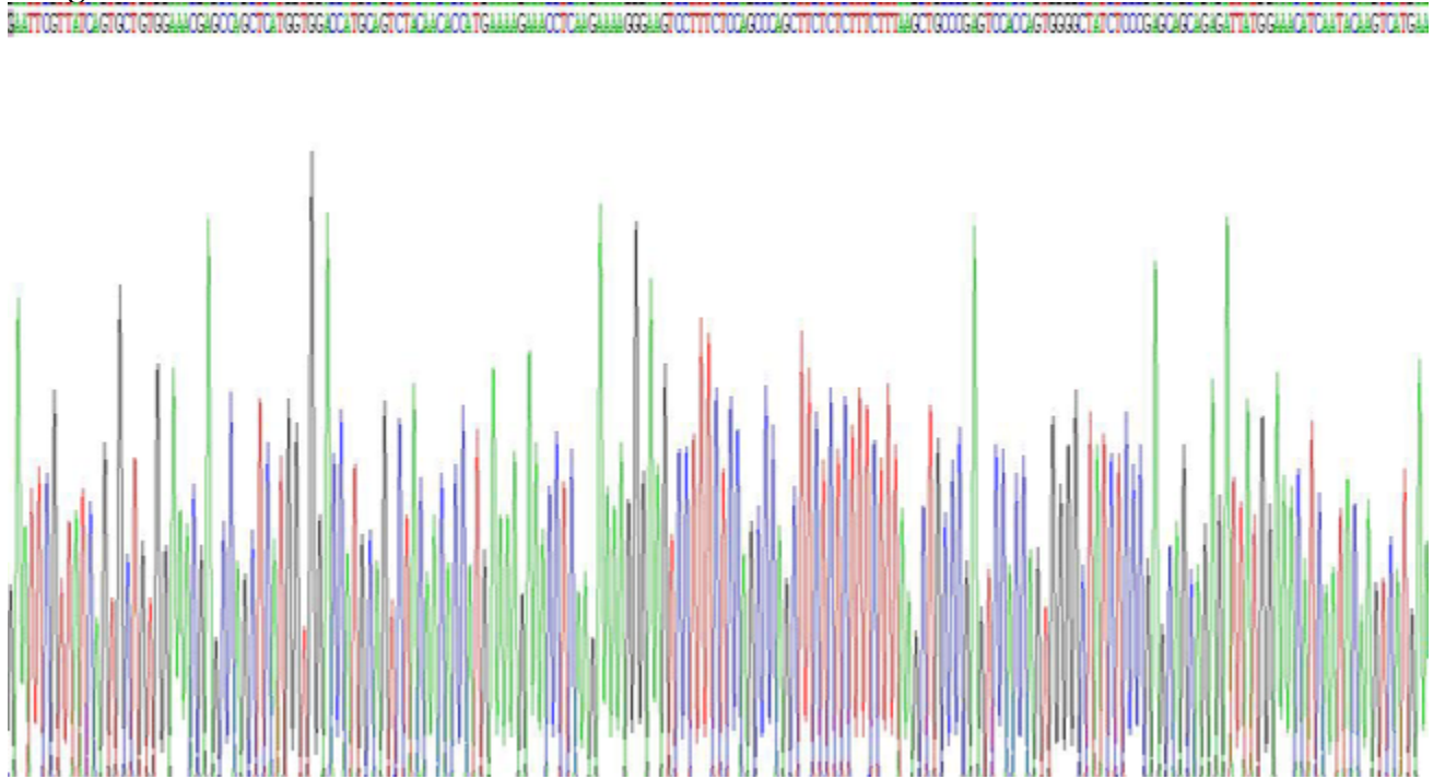
Figure . Gene Sequencing (extract)