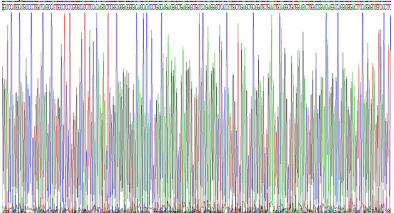
Figure . Gene Sequencing (extract)