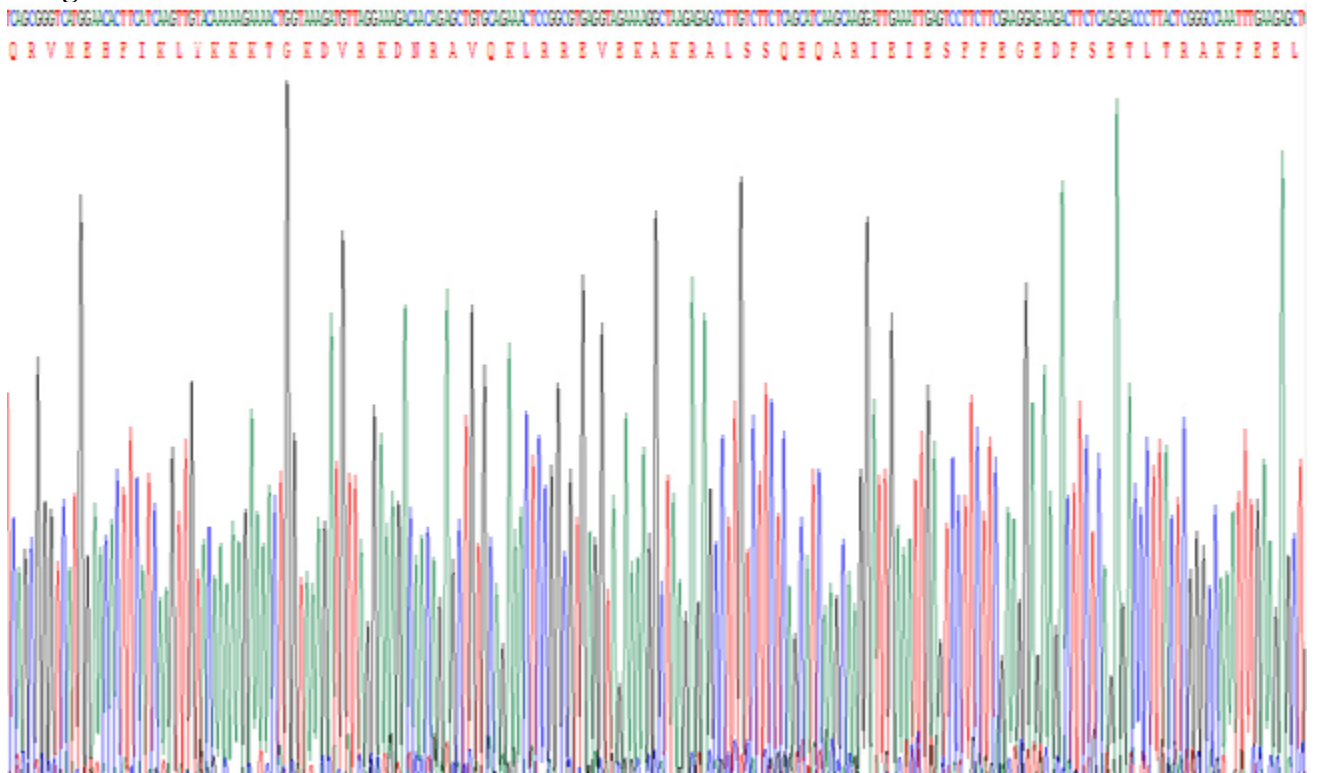
Figure. Gene Sequencing (Extract)