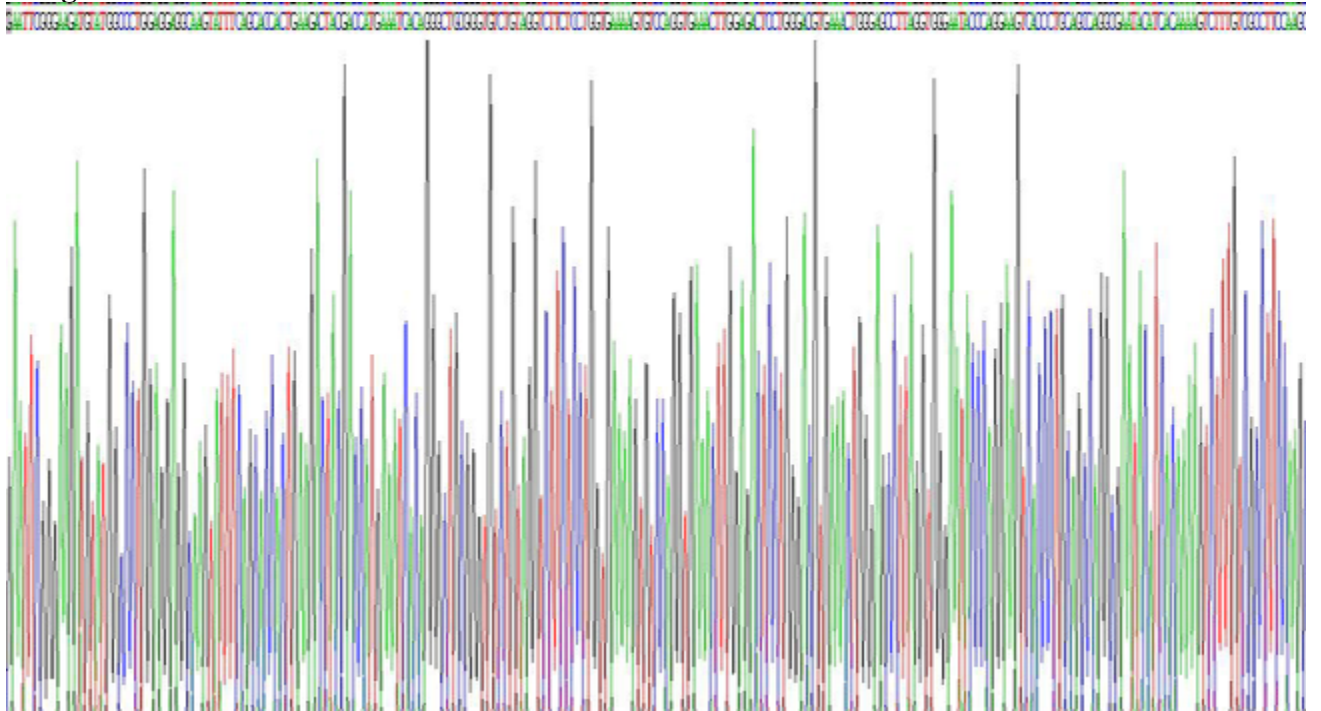
Figure . Gene Sequencing (extract)